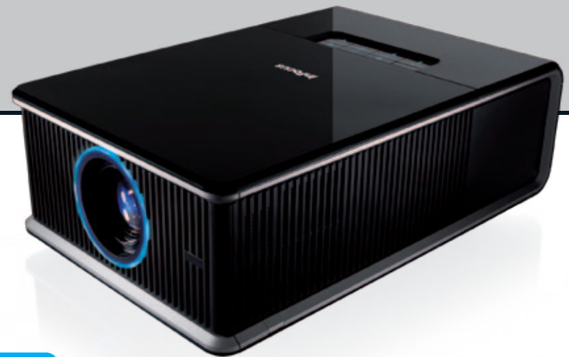
Optional Skin: Gloss Black

The IN5500 series delivers a stunning combination of HD resolution and vivid detail in true-to-life colors with a 6-segment color wheel, the latest DLP® DarkChip™ technology and the InFocus BrilliantColor implementation.